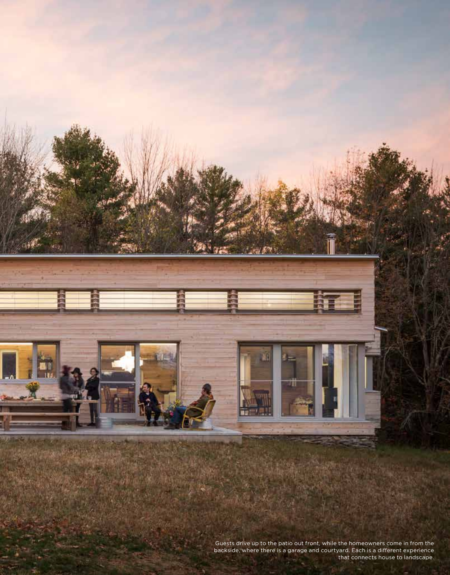
Guests drive up to the patio out front, while the homeowners come in from the backside, where there is a garage and courtyard. Each is a different experience that connects house to landscape.