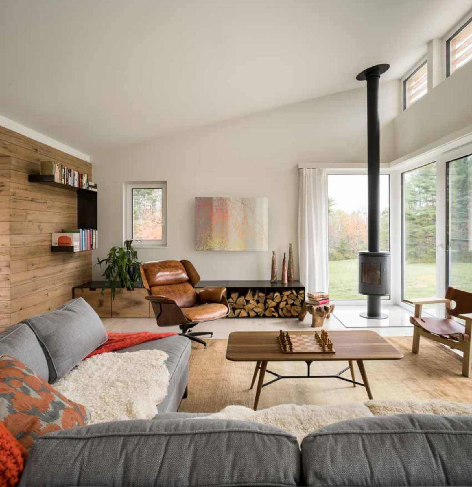
An elegant mudroom (opposite) looks out to a hemlock-clad barn. Windows provide solar gain during the day in winter, while a woodstove (above) takes over at night to provide ambience and heat.